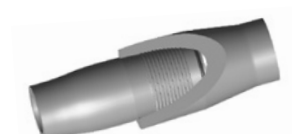
SS, SS HP